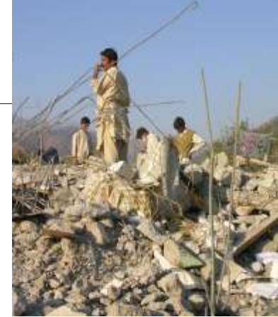
Earthquake devastation at Muzaffarabad, Pakistan

The theme of the Conference “Engineering and Disaster Management” is selected in view of the disasters caused in the recent past by Tsunami in Indonesia and earthquake in Pakistan. Untold loss of human lives and properties raised the questions whether UN-ESPAC region is equipped with the latest technological advancement to forecast, monitor, prevent and manage such disasters? Whether role of engineering in design, material selection and construction of facilities is adequate?